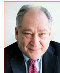
Marc Elrich County Executive, Montgomery Co. Government